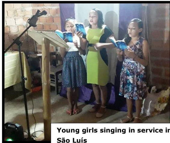
Young girls singing in service in São Luís