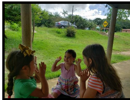
Primary class in Big Yard